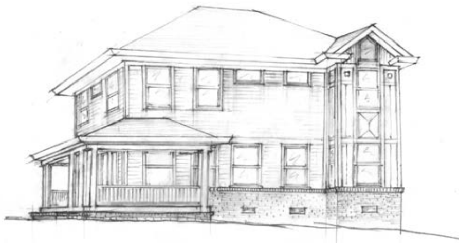
Perspective Study Corner of Mary and Moore